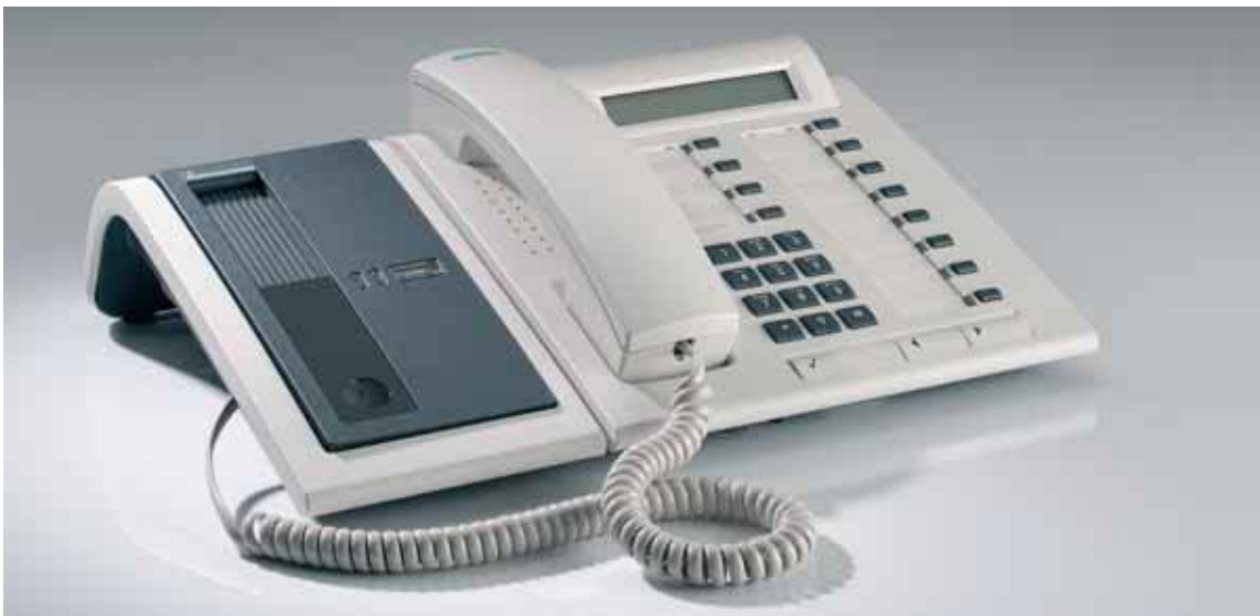
Optiset E privacy module with Optiset E telephone and support tray

Optimum speech quality in encrypted mode is ensured by automatic matching to the impedance of the telephone used.